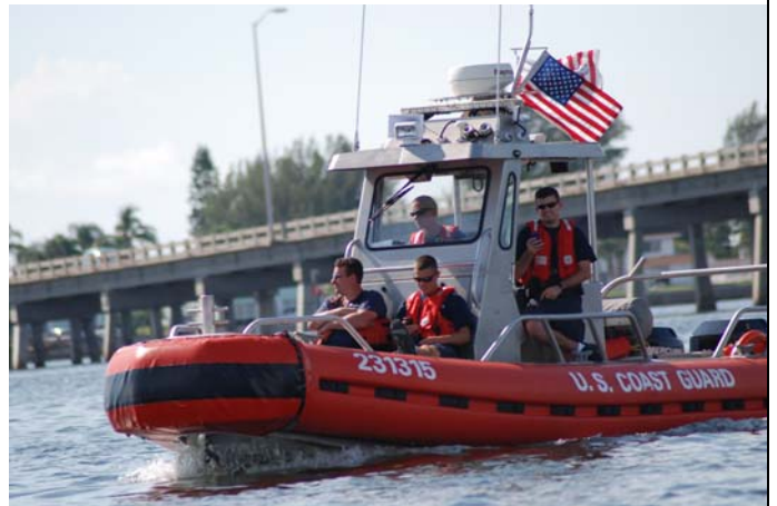
CG 25' Vessel on patrol in ICW