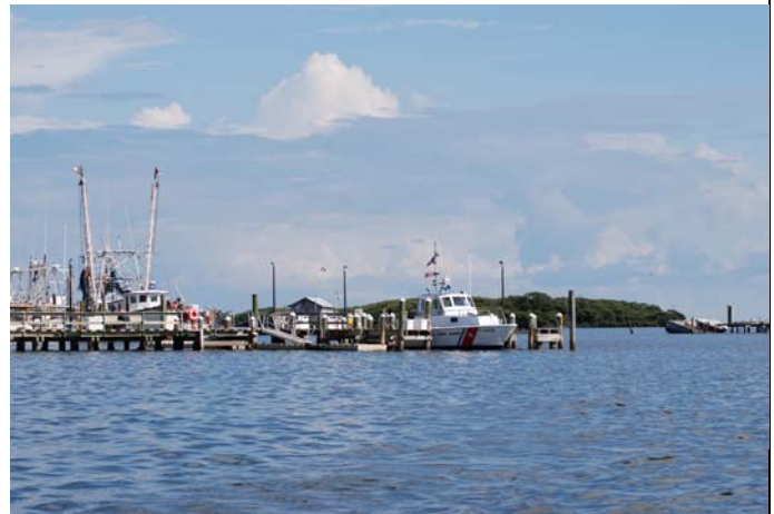
CG 41' UTB at Station Cortez dock

We had a training class in our September 10 th Flotilla meeting on the Coast Guard benefits we enjoy as Auxiliarists both on and off duty. No member training is scheduled for the October meeting as it is the annual elections.