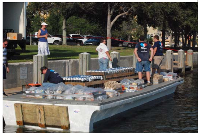
Firework barge for which we did a safety perimeter night patrol for the Ringling Museum

TIME: 1100 for fellowship 1130: Program Begins 1230 Lunch served